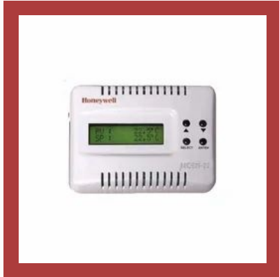
Cooling And Heating Thermostat