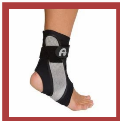
Ankle Support Brace