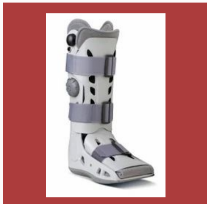
Walker Orthopedic Brace