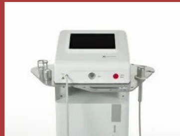
Mectronic Smart 15W Laser High Power Laser iLFY 15w Smart