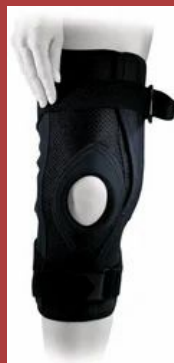
Lite Knee Brace