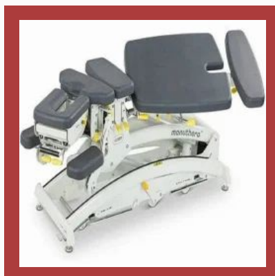
Mauthera 242 by Lojer Chiropracting Table with manual Traction & Tilt