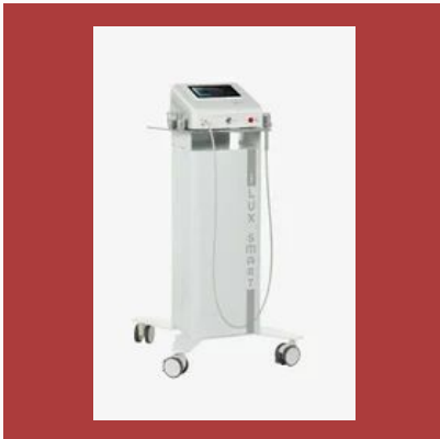
Laser Therapy Machine