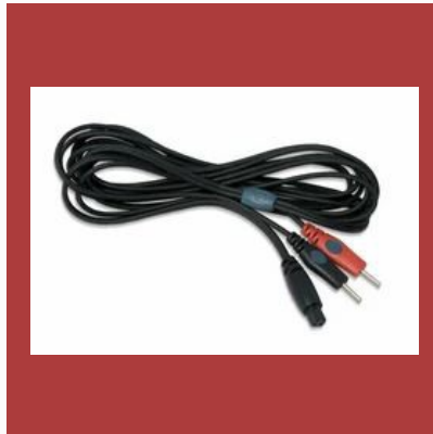
Lead Wire for Chattanooga Stim