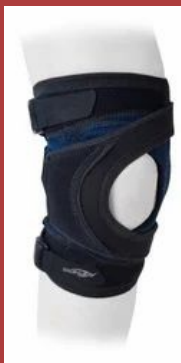
Patella Knee Brace