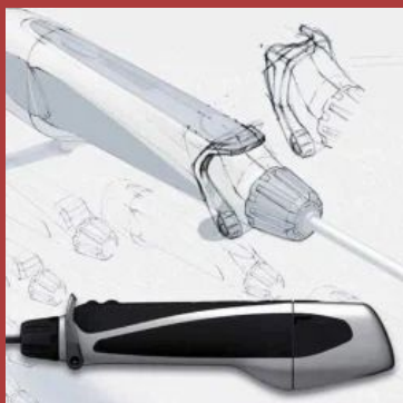
Shaver System (Wireless) for Arthroscopy