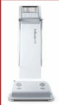
Body Composition Analyzer Inbody770s