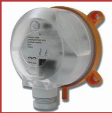
Differential Pressure Sensor