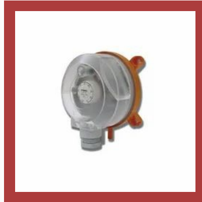
Differential Pressure Switch