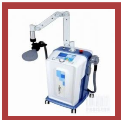
Super Inductive System- Sis Electromagnetic Physiotherapy Device