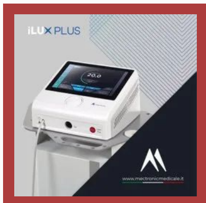
Mectronic Ilux Class 4 High Power/High Intensity Laser For Physiotherapy