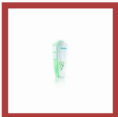
Aircast Air Stirrup Ankle Brace