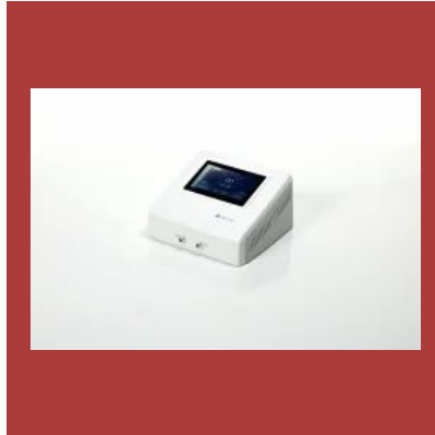
Intelect Advance Combo