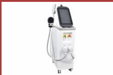
Physiotherapy Electrotherapy Equipment