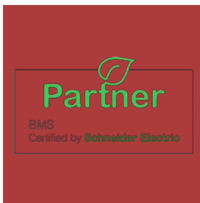
Building Management System Solution