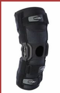
Donjoy Knee Brace - Drytex Playmaker