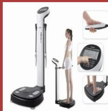
Body Composition Analyser - Inbody