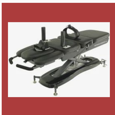
Spinal Decompression & Cervical Therapy Machine