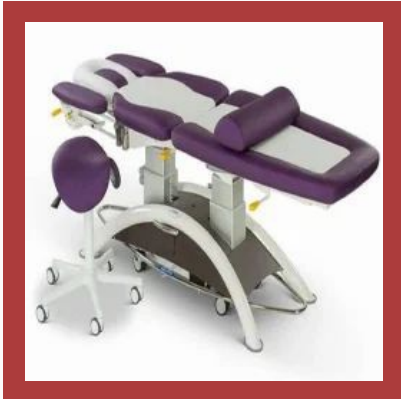
Motorised Treatment Table