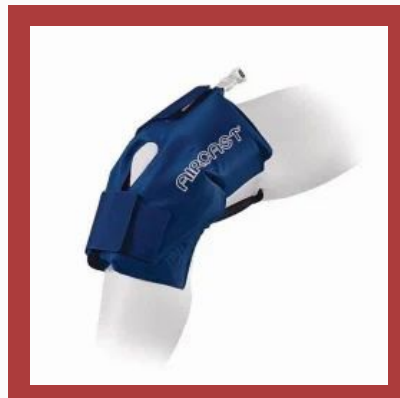
Knee Cryo Cuff Brace