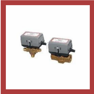
Honeywell FCU Valve