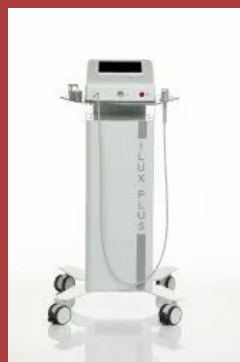
Combination Therapy Unit - Mectronic Hpl Smart Laser Ilux Lfy 10 810/980/1064 Nm Wavelength