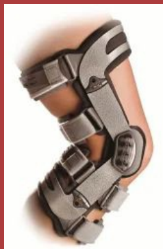
Acl Knee Brace