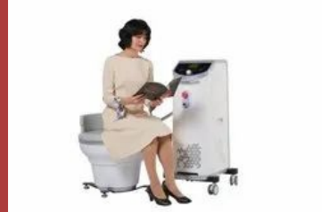
Urinary Incontinence Treatment