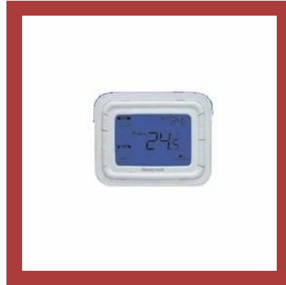
Digital Room Thermostat